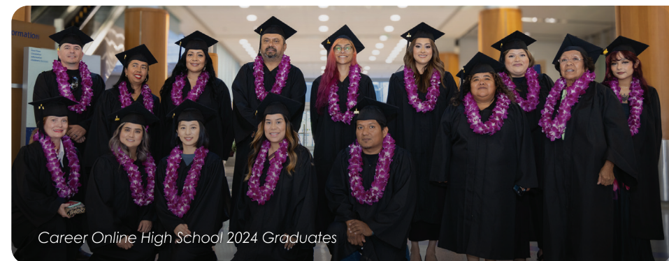
Career Online High School 2024 Graduates