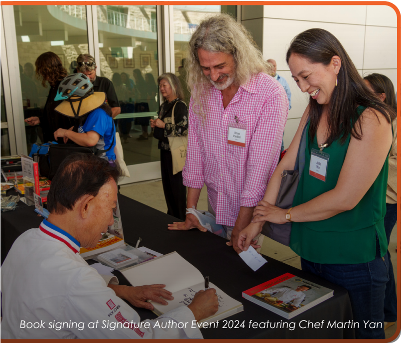
Book signing at Signature Author Event 2024 featuring Chef Martin Yan